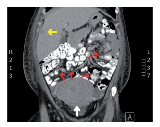
Fig. 1.— Abdominal CT scan: frontal section. Voluminous uterus (white arrow), liver metastasis (between lobe 5 and 8, yellow arrow) and mesenteric metastasis (red arrows).

Initial therapy consisted of ketoconazole as suppression of cortisol production, together with one (empirical) gift of somatostatin, perindopril as antihypertensive drug, and low molecular weight heparins in preventive dosage for the elevated risk of thrombosis. In search of the ectopic ACTH production locus, CT scan revealed a voluminous pelvic tumour widely disseminated to liver and peritoneum with multiple retroperitoneal adenopathies (Fig.1). Multiple subcentimetrical pleural noduli were seen in the posterior upper right lung lobe.